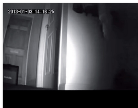
With IR light